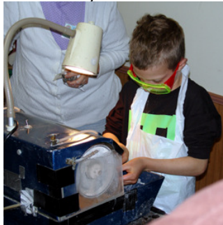
A young, rockhound polishing his cab.