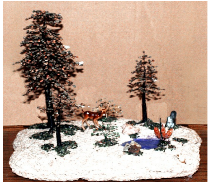
Sandy Keener's Gem Tree Scene