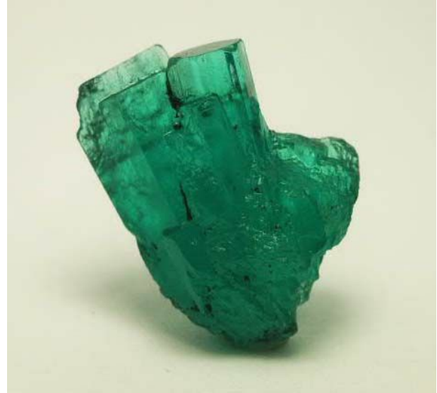
Beryl (var. Emerald)